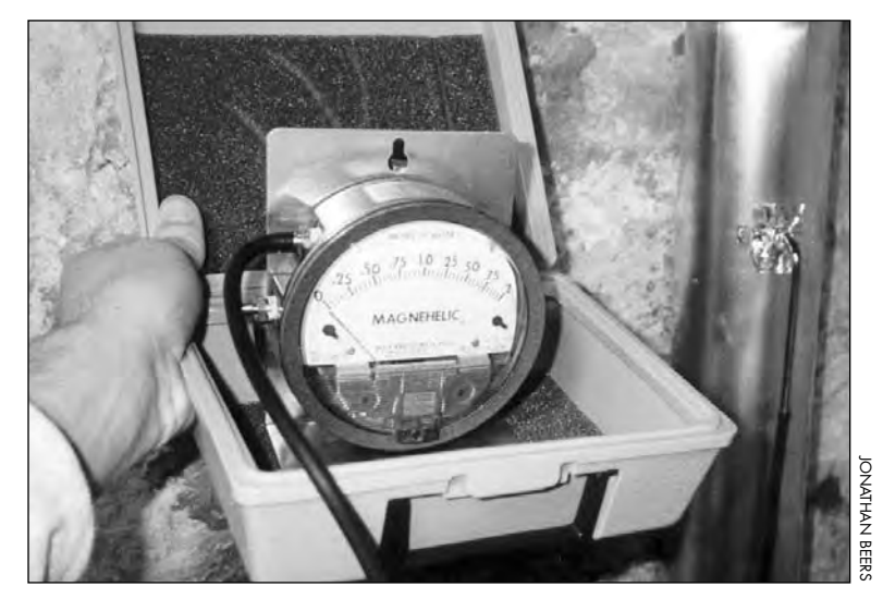
(left) If space is tight between the dryer and the wall, a periscope vent allows the dryer to be 2 inches closer to the wall. (right) I stuck this guage's right-angled terminal tube into a vertical section of the vent to measure static pressure.

to 64 ft, if rigid metal duct is used, and no 90° elbows are utilized (or up to 44 ft with two elbows). Maytag's models that carry model numbers starting with MDE can handle similarly sized duct runs.