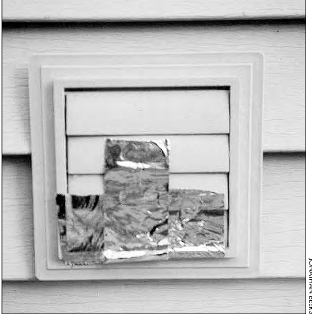
By taping shut first, two, and then, three louvers on the vent hood, I raised static pressures in the venting system.

number of watt-hours used per cycle is largely a function of the amount of time the fan is on and drum is turning, I used watt-hours per load as a way of measuring drying time without having to babysit every test. I did babysit a couple of tests to make sure that the electric use during the cool-down portion of the cycle didn't vary.